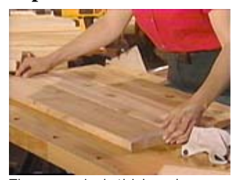
Three one inch thick cedar decking boards make the bottom of the chest.