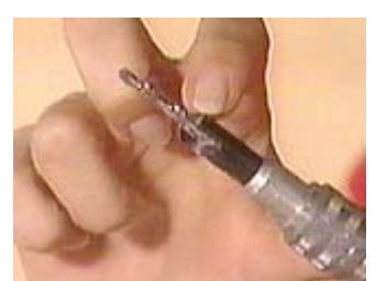
Use a counter sink bit to allow the head of the screw to set deep enough for a plug.