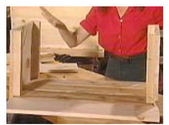
Build the sides first then attach the front and back.

Using a countersink bit, pre-drill for the screws, boring a 3/8" deep countersink channel so that the screw's head will sink deep into the hole. Use a jig to help you space the screws evenly. Build the other end in the same manner.