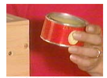
Use a food grade wax like bees wax to insure the finish is non toxic.

Hammer in the plugs to cover the screw heads. Take your length of steel chain and screw one end to the inside of the trunk, the other end to the lid of the trunk. Sand and finish the chest's exterior surface with beeswax polish.