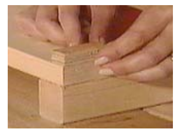
Make a jig to help locate the screws evenly.