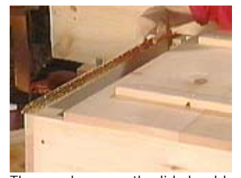
The overhang on the lid should be even on the front and sides.

Balancing the ends using idle body parts, pre-drill and countersink the long facing boards, attaching them to the corner posts at both ends. Use the larger jig to space the screws accurately in the corner post. Now you have the basic box. Slip the box over the three bottom boards. Attach the bottom boards to the box using six pre-drilled, countersunk screws on each end of the trunk ½" up from the bottom.