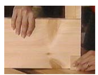
Make a new jig for the front so that the screws go into the corner posts.

Using a countersink bit, pre-drill for the screws, boring a 3/8" deep countersink channel so that the screw's head will sink deep into the hole. Use a jig to help you space the screws evenly. Build the other end in the same manner.